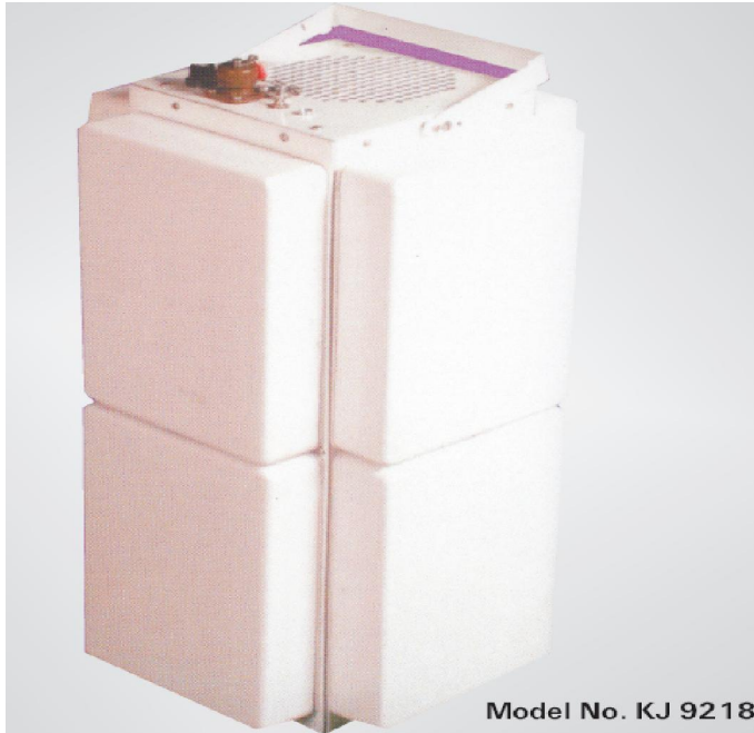
Model No. KJ 9218