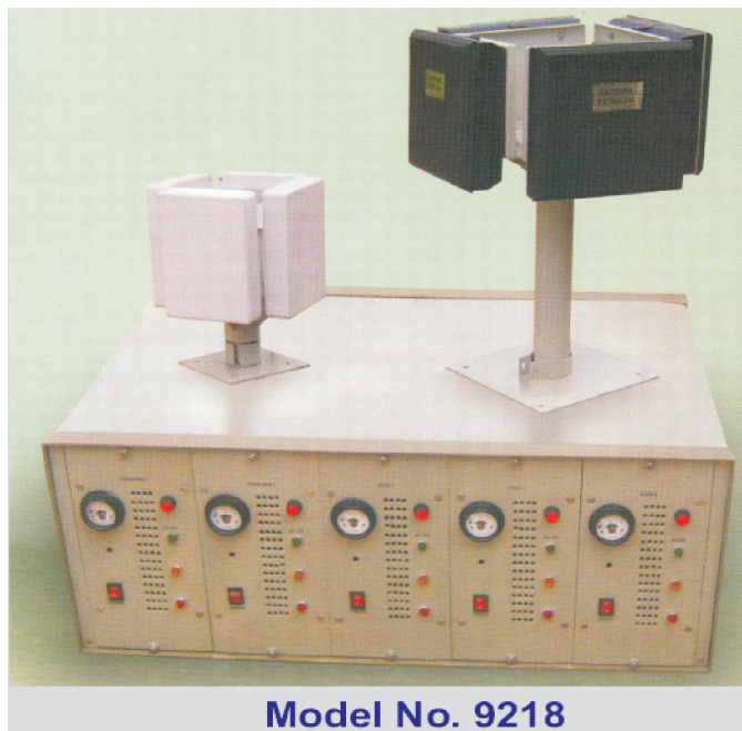
Model No. 9218