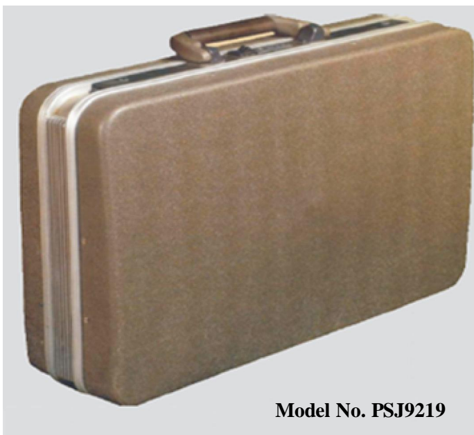
Model No. PSJ9219